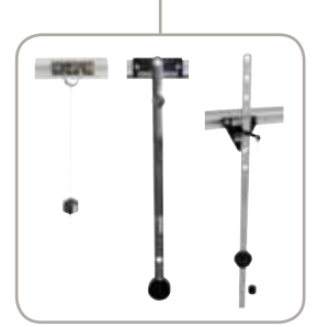
HVT12a - Pendulum Module

The modular nature of the standard unit allows optional extras HVT12a , b , c , and h to be added as and when budgets permit.