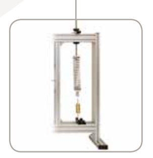
HVT12h - Mass Spring System Module