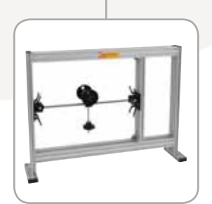
HVT12c - Beam Bending (Transverse) Vibrations Module