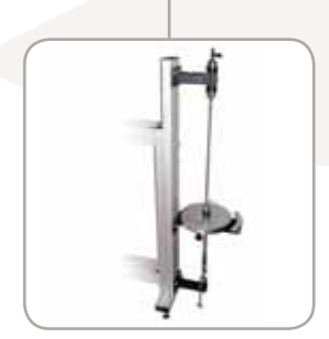
HVT12b - Torsional Oscillation (Free and Damped) Module